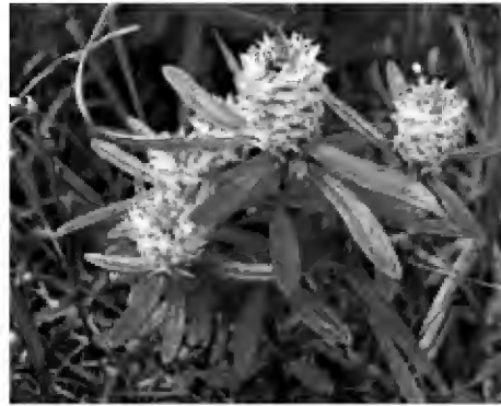
Figure 12. Cross-leaf milkwort ( Polygala cruciata ) at an abandoned cranberry marsh along River Road.